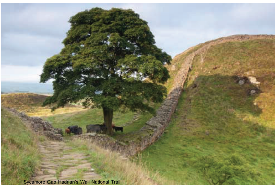
Sycamore Gap Hadrian's Wall National Trail

Next month we will introduce you to the local delivery officers!